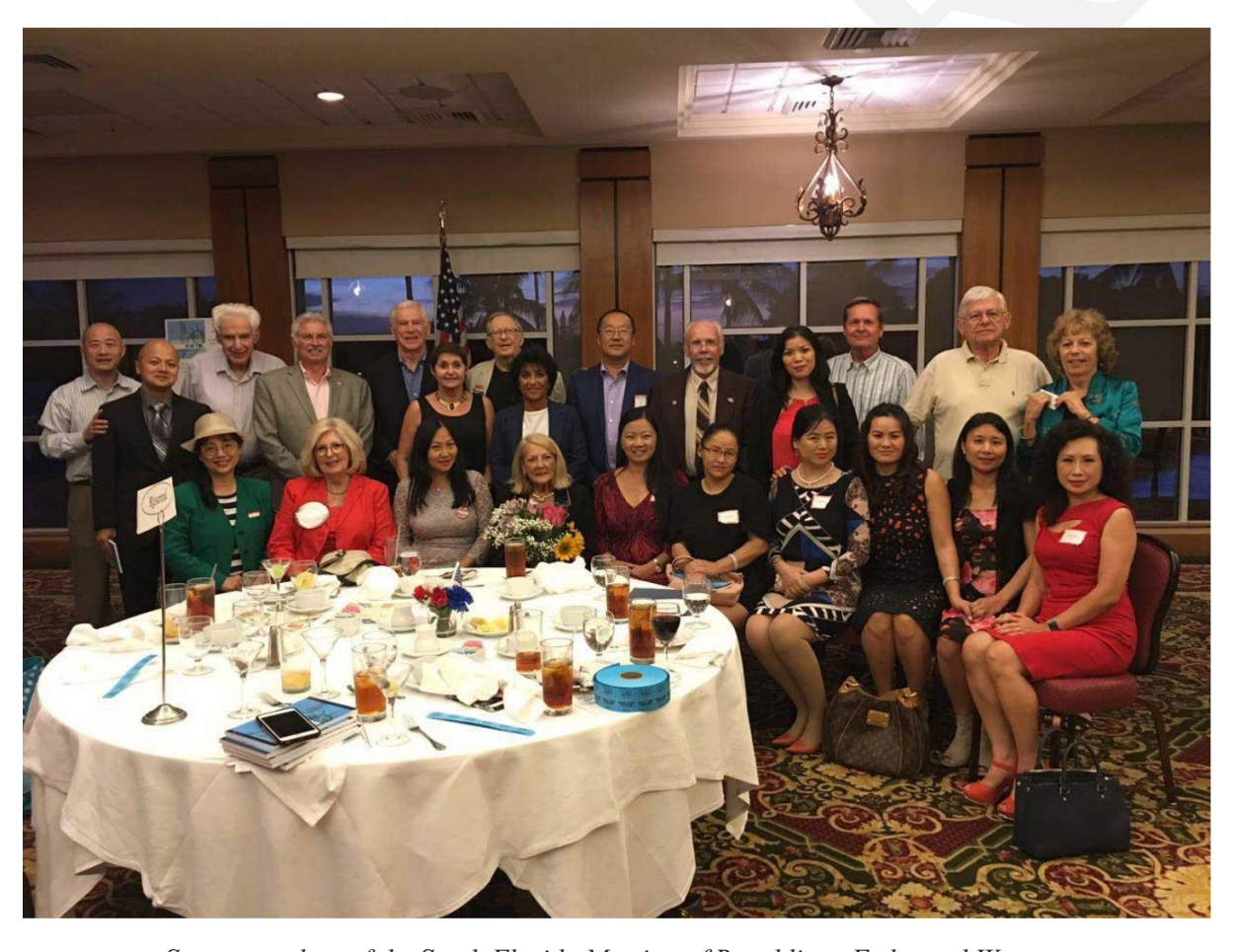
Some attendees of the South Florida Meeting of Republican Federated Women, June 23, 2016